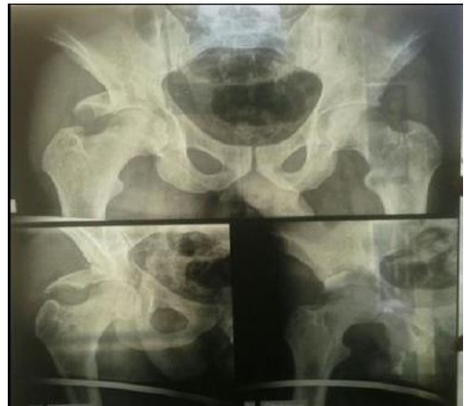
Fig 1: X- ray AP view of the pelvis showing fracture posterior wall of acetabulum.

post-operative radiological images of two cases were presented in [Figures-1 & 2].