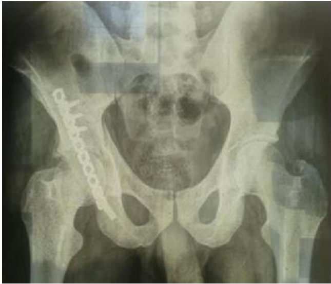
Fig 3: Immediate postoperative x ray showing fixation of the posterior wall with reconstruction plate and cancellous screws.