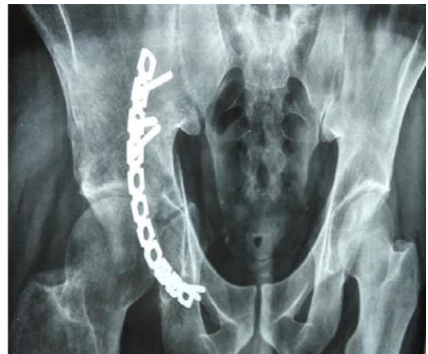
Fig 8: 4 months postoperative showing fracture healing. Pre- and post-operative figures of [case-2]