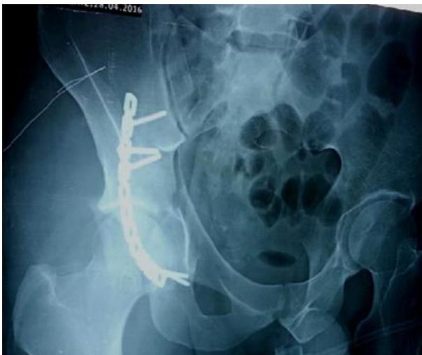
Fig 7: Postoperative oblique view showing good reduction.