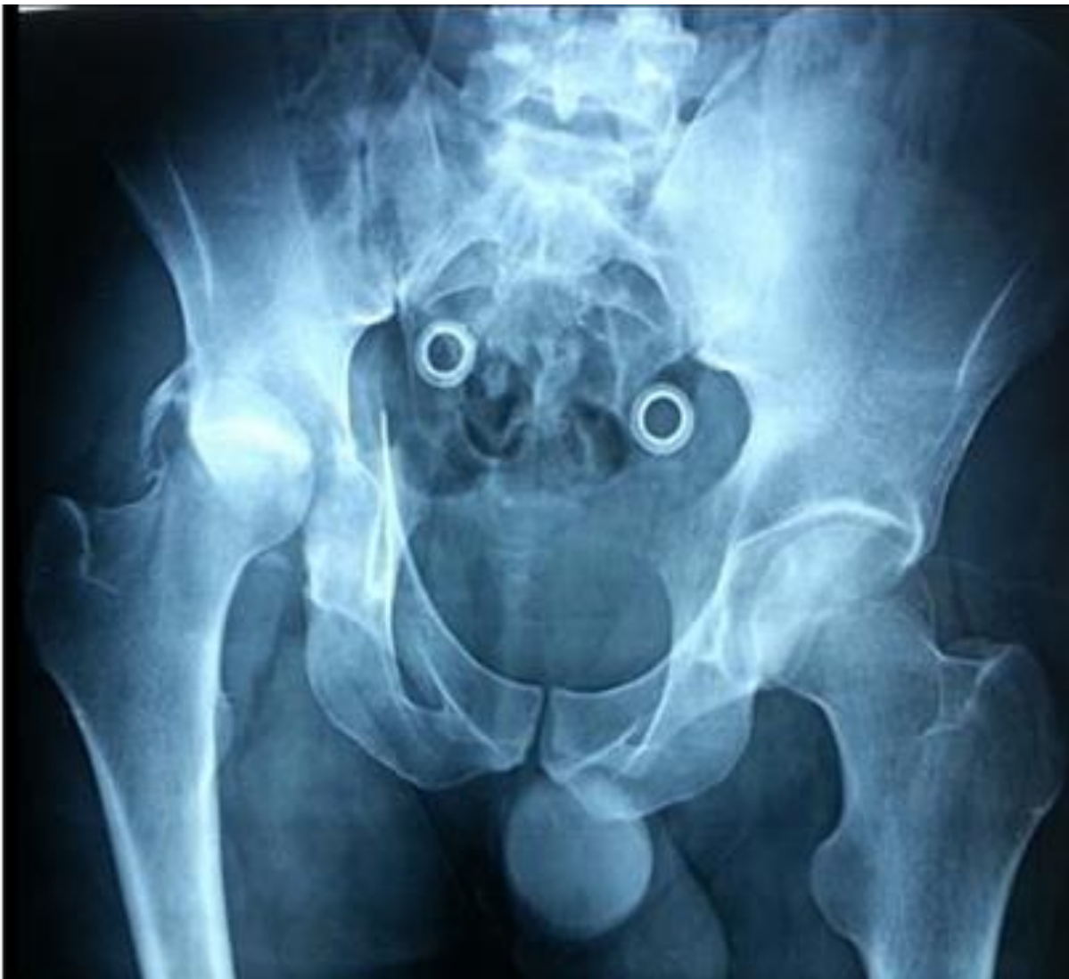
Fig 5: Oblique view showing posterior acetabular fragment with instability of hip joint.