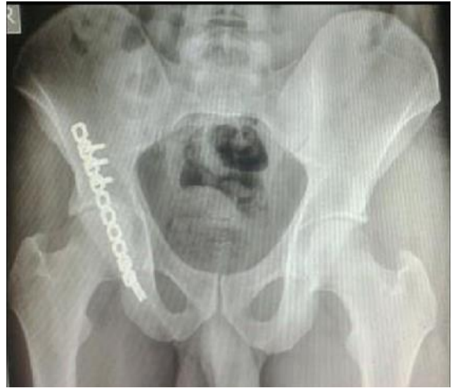
Fig 4: 12 months postoperative showing complete union. Pre- and post-operative figures of [case-1]