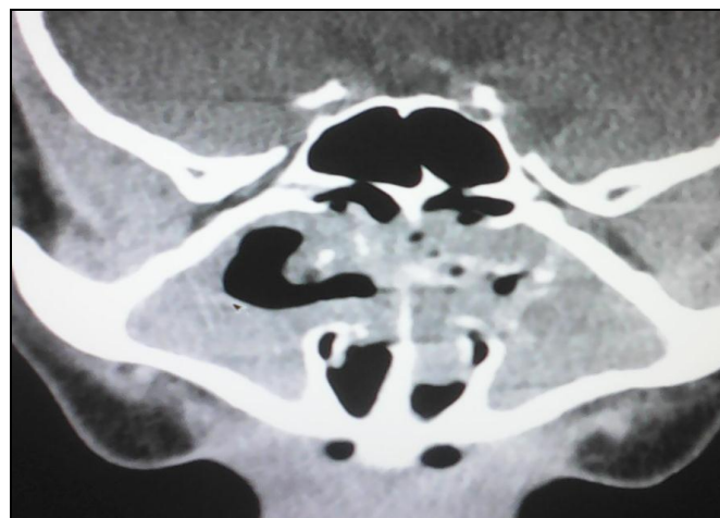
Fig 2: There is soft tissue mass occupying the whole maxillary sinuses with no contrast enhancement. No destruction or erosion of adjacent bone. Nasomaxillary non-enhancing soft tissue mass. Mucocele and Nasomaxillary polyp as differentiates