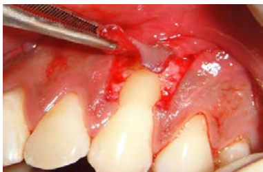
Fig 4: Split-Full-Split Thickness flap is elevated