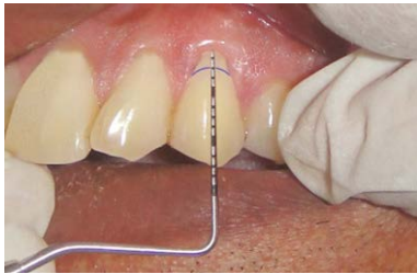
Fig 1: Pre-operative picture of group

present study. Results on continuous measurements are presented on Mean \pm SD (Min-Max) and results on categorical measurements are presented in Number and percentage (%). Significance is assessed at 5 % level of significance. Student t-test (two tailed, dependent) has been used to find the significance of study parameters between baseline - 3 months, baseline- 6 months and 3 months - 6 months. 90% Confidence Interval for mean has been computed.