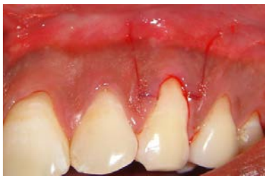
Fig 3: Horizontal incision given