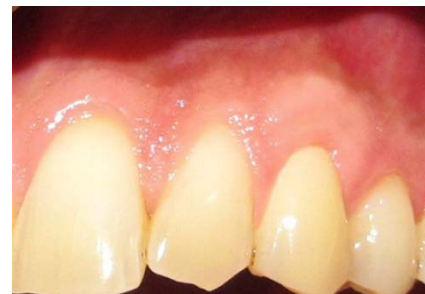
Fig 8: 6- months post-operative for Group-II