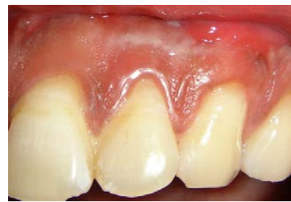
Fig 7: 6 months post-operative for Group-I