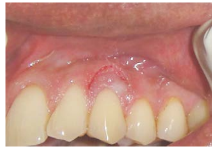
Fig 6: Partial thickness flap is advanced coronally without sutures