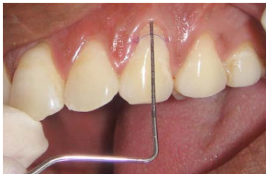
Fig 2: Pre-operative picture of group