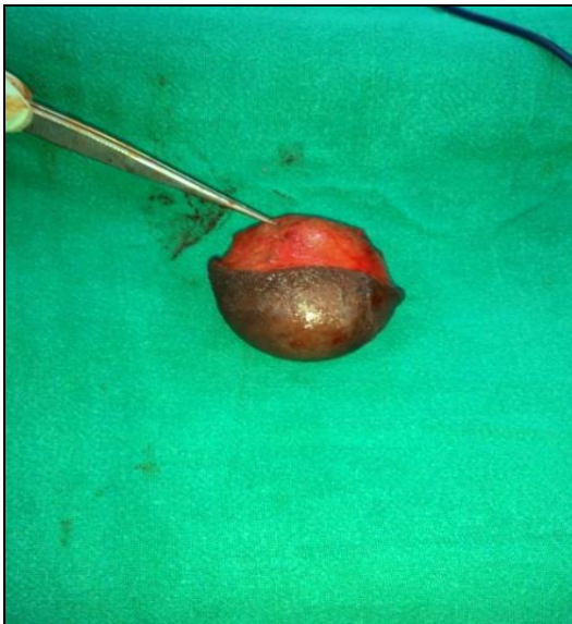
Fig 1: Post-operative picture showing Neuro Fibroma on scrotal region

Surgical exploration was done for swelling. [Figure 1]. Then we excised the skin with proper margins and sent for histopathology. Margins were freshened with primary closure of the wound was done. It healed very well. To our surprise, on histopathology diagnosis came as neurofibroma of the scrotum. Microscopically, it was showing proliferation of haphazardly arranged neural tissue growing beneath a flattened epidermis [Figure 2] and [Figure 3].