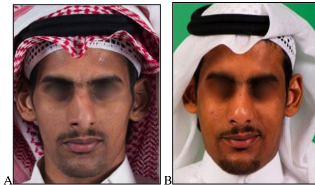
Fig 2: A) Preoperative, B) postoperative