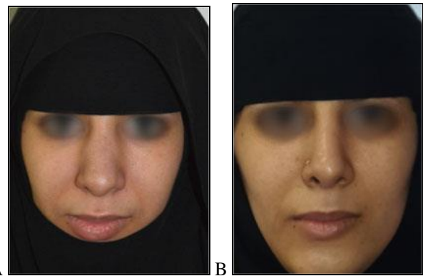
Fig 3: A) Preoperative, B) postoperative

Low-to-high osteotomy. Low-to-Low osteotomy.